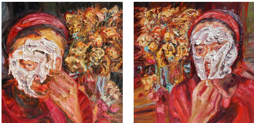
Figure 7. “The innovation of molting 1” and “the innovation of molting 2”