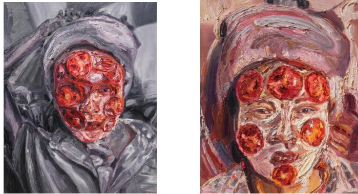
Figure 4. “The season of beauty 4” and “Tomato” Source: Natsuree Techawiriyataweesin