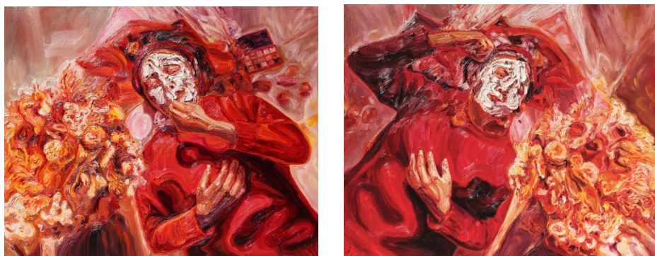
Figure 8. “in the state of chrysalis 1”