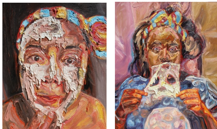
Figure 5. “hidden in the chrysalis 1” and “hidden in the chrysalis 2” Source : Natsuree Techawiriyataweesin

The painting series in phrase three includes “hidden in the chrysalis 1” (60x50 cm), “hidden in the chrysalis 2” (100x120 cm), “before becoming a butterfly 1” (120x100 cm), “before becoming a butterfly 2” (120x100 cm), “The innovation of molting 1” (100x100 cm), “the innovation of molting 2” (100x100 cm), and “in the state of chrysalis 1” (160x200 cm).