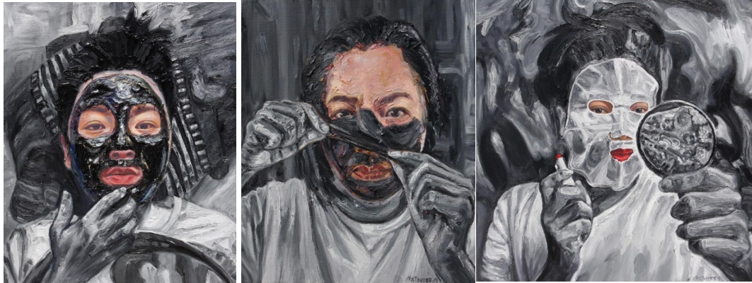
Figure 2. The painting titled “Black Mask 1”, “Beneath the mask”, and “Makeup Me” Source : Natsuree Techawiriyataweesin

rules like doing make-up for work or too much enhancing their beauty. It is like wearing a mask that will get the cost of pain. These social memories are after-images that are all about the beauty that most women want to be. The painting series in phrase one includes oil-on-canvas paintings entitled “Black mask 1” (60x50 cm), “Beneath the mask” (60x50 cm), and Makeup Me (80x80 cm).