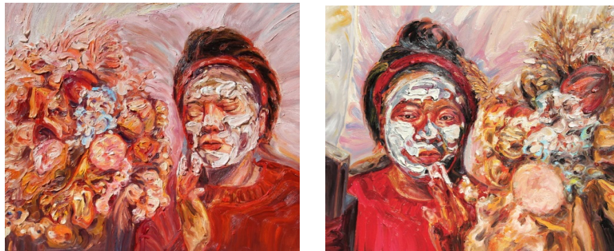
Figure 6. “before becoming a butterfly 1” and “before becoming a butterfly 2”