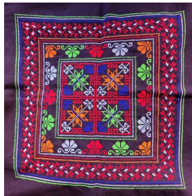
Figure 4: Embroidery of Hongyao and Yao Ethnic Groups in Longsheng County 2.

Exquisite skills: Red Yao women are skilled in needle embroidery. They do not need to draw a picture first, but rely entirely on experience to conceive embroidery patterns based on the "fabric holes" in the warp and weft of the base fabric. When embroidering, they mainly use black or navy blues cloth as the base, and use various colored silk threads to embroider patterns. There is no need to draw a picture during embroidery, and the position of the pattern is determined by the warp and weft lines of the base cloth. Then, they use various colored silk threads to embroider colorful patterns.