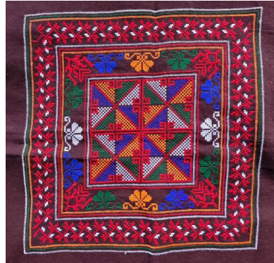
Figure 3: Embroidery of Hongyao and Yao Ethnic Groups in Longsheng County 1.

Exquisite skills: Red Yao women are skilled in needle embroidery. They do not need to draw a picture first, but rely entirely on experience to conceive embroidery patterns based on the "fabric holes" in the warp and weft of the base fabric. When embroidering, they mainly use black or navy blues cloth as the base, and use various colored silk threads to embroider patterns. There is no need to draw a picture during embroidery, and the position of the pattern is determined by the warp and weft lines of the base cloth. Then, they use various colored silk threads to embroider colorful patterns.