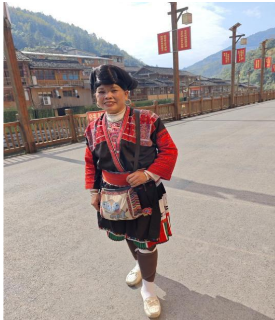
Figure 2: Red Yao and Yao ethnic costumes in Longsheng County

(2) Characteristics of Embroidery Art of Hongyao and Yao Ethnic Groups in Longsheng County: Vibrant Colors: The clothing of Hongyao is mainly in the color of red, complemented by black, white, green, blue, yellow and other colors, creating a strong color contrast that makes the clothing particularly dazzling and bright in the sunlight.