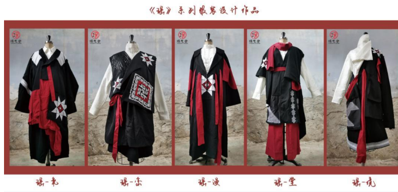
Figure 5: Innovative fashion design incorporating Yao embroidery elements.

Propose the innovative application methodology of Yao embroidery in innovative fashion design: Through case analysis, design practice, and other methods, explore the innovative application of Yao embroidery in innovative fashion design, including pattern innovation, color matching, material fusion, and technique improvement. Summarize a practical and feasible methodology for innovative application of Yao embroidery, providing practical guidance for designers.