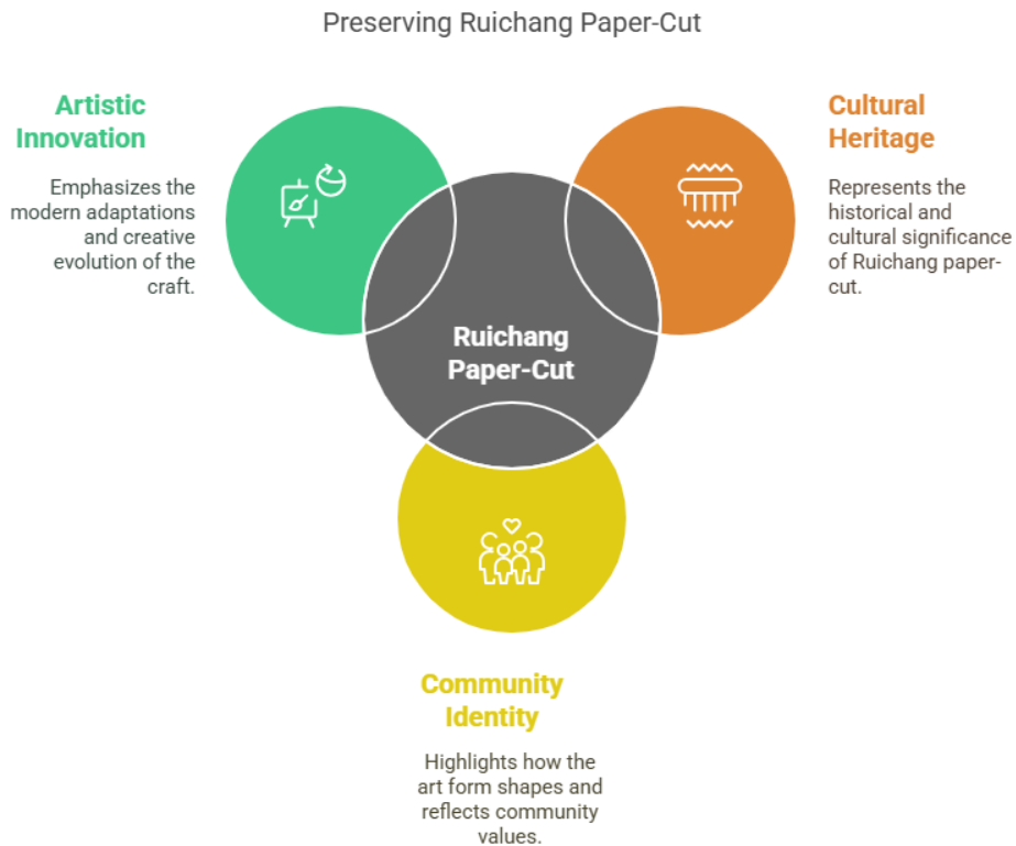
Figure 3: Diagram show the process of Ruichang paper-cut has a long history and profound cultural heritage.

Ruichang paper-cut has a long history and profound cultural heritage. Its unique artistic techniques and symbolic meanings demonstrate its important value as an intangible cultural heritage. Ruichang paper-cut is a carrier of local culture and social functions its protection must take into account both traditional inheritance and modern development.