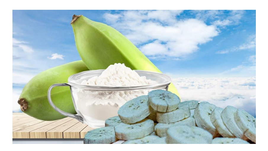
Figure 2.4: Photo by Phrakrusophonweranuwat, Director of community enterprises through innovative processes to product standards, Suphanburi Province