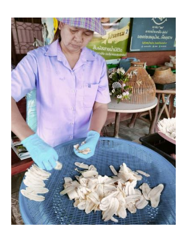
Figure 2.5

The idea revolves around community enterprise and developing management capabilities for the Conservation Center of Banana Varieties in Suphan Buri Province.