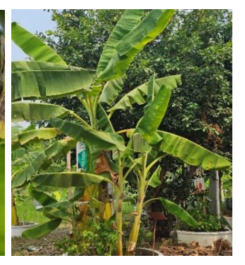
Figure 1,2,3