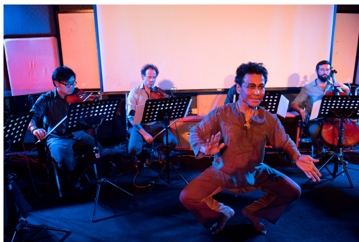
Figure 25. Malaysian choreographer and Indian classical dance master Ramli Ibrahim, who participated in SoundBridge Festival 2015 through both performance and collaboration with young Malaysian composers Tee Xiao Xi in her work “The Silent Path” for dancer, multi-instrumentalist, zhong ruan, flute and string quartet.

From the perspective of senior interdisciplinary practitioners, this commitment to cross-media dialogue carries broader cultural and intellectual significance. Malaysian choreographer and Indian classical dance master Ramli Ibrahim , who participated in SoundBridge 2015 through both performance and collaboration with young Malaysian composers Tee Xiao Xi in her work “ The Silent Path ” for dancer, multi-instrumentalist, zhong Ruan, flute and string quartet, emphasised the importance of cultivating creative and intellectual discourse in music beyond commercial imperatives. For him, festivals such as SoundBridge play a critical role in affirming music’s intrinsic creative power to shape thought, perception, and social imagination.