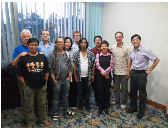
Figure 31. The juries and mentors of Goethe Institut SEA young composer's competition and workshop (Indonesia 2011)

This model strongly informed SoundBridge's emphasis on cross-border artistic exchange and peer learning. However, the Goethe-Institut initiative also underscored structural vulnerabilities: dependence on external cultural institutions, limited local infrastructure for sustaining outcomes, and the absence of long-term field-based engagement. SoundBridge was conceived in part as a response to these gaps, seeking to localize international exchange while embedding it within regional cultural contexts.