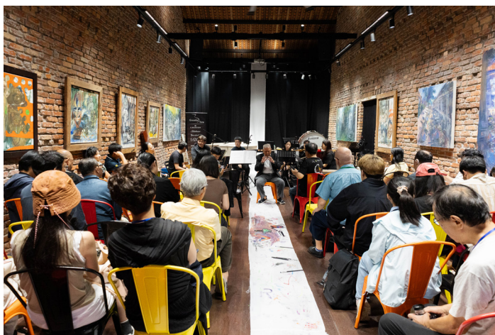
Figure 10. In the 7 th edition of SoundBridge, Ensemble Studio C performed Echoes II by Ramon Santos within the MASTER Series mini-portrait concert, highlighting the integration of composer-focused curation and the festival's resident ensemble.

In doing so, it offers an alternative framework for contemporary music education and cross-cultural artistic dialogue in Southeast Asia, and has been described as a “resonant bridge” connecting diverse Asian sound worlds (Zou, 2018). Through this ongoing curatorial expansion, SoundBridge has transformed from a concert-based platform into a multi-layered curatorial ecology where composition, improvisation, visual art, and research practice converge within shared temporal and spatial frameworks. Rather than being defined primarily by formats, the festival is increasingly shaped by a sense of curatorial responsibility—balancing immediacy with legacy, experimentation with continuity, and local urgency with a growing regional and intergenerational consciousness.