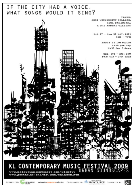
Figure 13. Poster of the 1st KL Contemporary Music Festival 09 (KLCMF09) from 27 – 29 November 2009