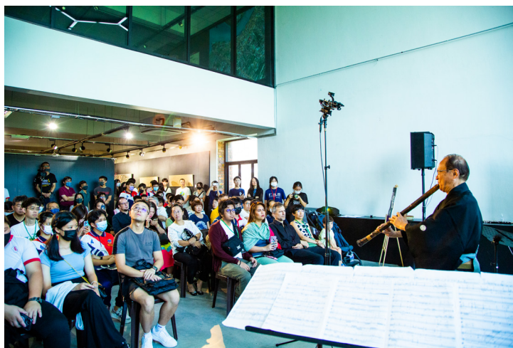
Figure 12. In the 6 th SoundBridge Festival (2023), Japan’s Trio AR presented a lecture-concert featuring works specially commissioned and written for the ensemble.

Video link 3: SoundBridge Festival’s website: https://youtu.be/i6hhZG1WZ2U