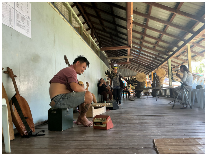
Figure 20. During the 5 th edition of SoundBridge, students participating in the 1 st time Malaysia Borneo (Sarawak and Sabah) field trip conducted interviews with Kenyah tribe dancers and sape players at the longhouse in Kampung Long Moh, located in the Telang Usan region of Sarawak, Borneo — a traditional dwelling of the Kenyah Dayak community.