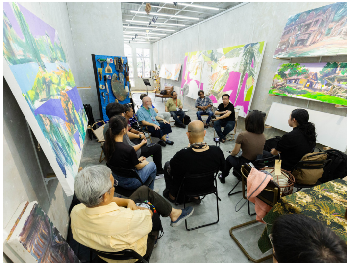
Figure 4. SoundBridge Festival participants in dialogue. Participants and invited panellists engaged in a public discussion on “Trends in Cross-Media Contemporary Music” at the 7 th SoundBridge Festival, 2025.