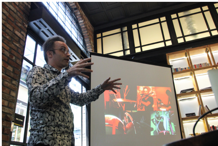
Figure 5. Artist Jean-David Caillouët (French/Thailand) shared his perspective on cross-media practices during a panel discussion at the 3 rd SoundBridge Festival, 2017.

Video link 1: SoundBridge Festival 2013-2023 at the youtube channel playlists: https://www.youtube.com/@soundbridgemusicfestival/playlists