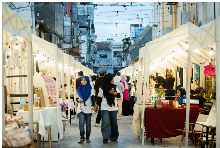
Figure 29. In 7 th SoundBridge Festival 2025, three-day art market “SoundBridge Bazaar” at the alley behind one of the festival venue Kluang Days Art space and café in the old town Kluang