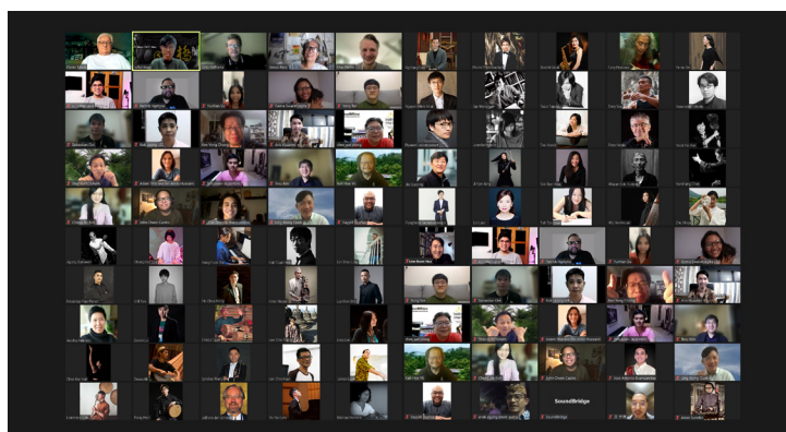
Figure 45. In 5 th SoundBridge Festival 2021 (Virtual), group photo of all online guests!

Within this context, the notion of “bridge” extends beyond metaphor to describe a set of operational conditions: between generations (emerging and established artists), between geographies (local, regional, and international), and between epistemologies (traditional knowledge systems and contemporary artistic practice). SoundBridge thus functions not only as a platform, but as a mediating structure through which these relationships are continuously negotiated and redefined.