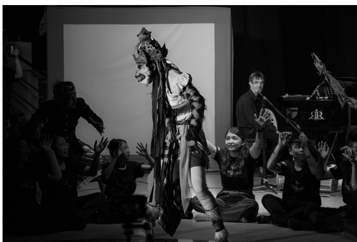
Figure 28. In 7 th SoundBridge Festival 2025, Students of Kluang primary Chong Hwa 2 took part in a two-day Kecak workshop during the festival and finally go onstage to perform with the famous Semara Ratih Gamelan group from Bali.