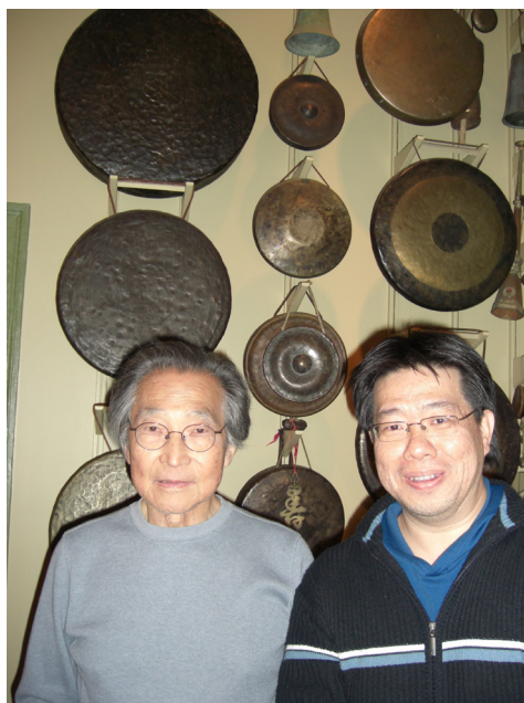
Figure 43. With my mentor late Chou Wen-chung at his house at New York City.

confluence of Asian musical heritages, Chou emphasised Southeast Asia's unique position at the intersection of multiple cultural lineages—and the responsibility of artists from the region to cultivate contemporary practices grounded in their own historical and cultural contexts. His encouragement served as a reminder that meaningful contemporary work must remain accountable to place, memory, and responsibility.