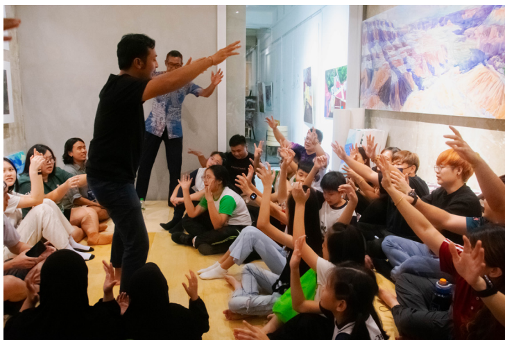
Figure 37. In 7th SoundBridge festival, Semara Ratih Gamelan group (Indonesia) conducting kecak for local young primary school students

working with younger composers—often unconstrained by entrenched stylistic expectations—prompted a reassessment of habitual artistic approaches and revitalised collaborative risk-taking. Mentorship thus emerged not as instruction, but as shared inquiry into material, structure, and cultural reference.