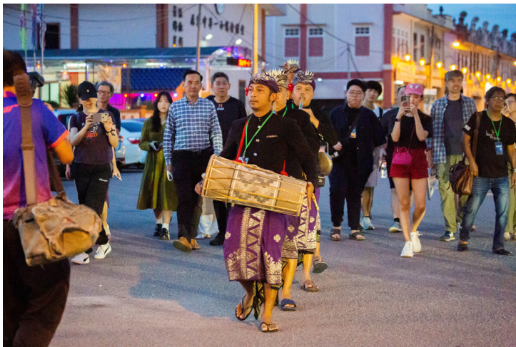
Figure 36. In 7th SoundBridge Festival, Samara Ratih Gamelan group (Indonesia) parading and leading the guests from the art exhibition venue Kluang Days to the festival opening venue at the primary school Chong Hwa 2 auditorium

Video link 8: 7th SoundBridge Festival 2025 — “MASTER Series I”: Miniature Portrait Concert of Ramon Santos (Philippines). Alingawngaw II (Echoes II) for Chinese instrumental and performed by Ensemble Studio C, with conductor Ya-ou Xie. https://youtu.be/HdaacJum-Hc?si=Q9zWWhsVcL1_tv69