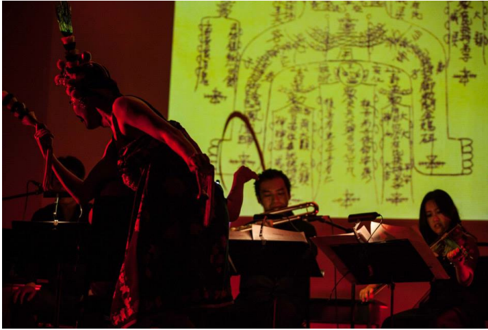
Figure 22. Interdisciplinary performance integrating music, dance, visual art, or live electronics at SoundBridge.