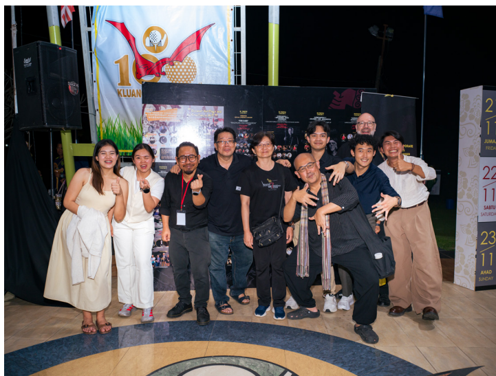
Figure 11. In 7 th SoundBridge Festival 2025, Students of PGVIM performed at “Dream for future” with their collective composition “Social Dilemma” collaborated with Thai composer/Sound artist Pradit Saengkrai.