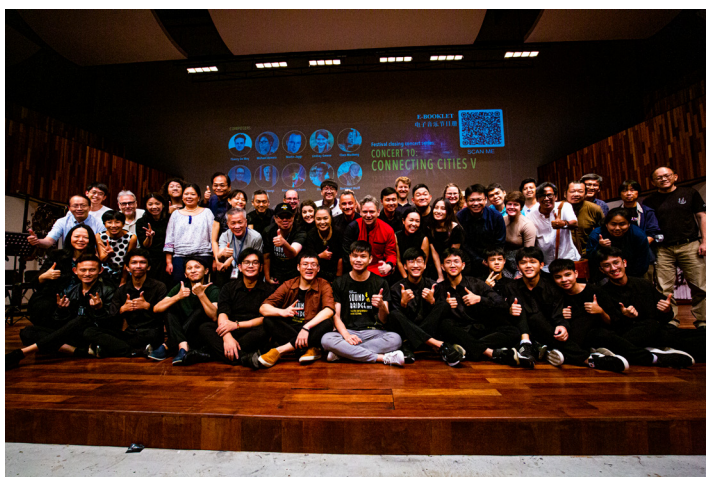
Figure 32. In 6 th SoundBridge Festival 2023, closing concert with all the participants.

A defining feature of SoundBridge is its sustained commitment to Malaysian composers and artists across generations. By foregrounding world premieres, lecture concerts, and interdisciplinary collaborations, the festival has created a space in which local artistic voices are not peripheral, but central to regional and international dialogue. This positioning challenges hierarchical cultural flows that often privilege Euro-American centers, proposing instead a horizontal network of exchange grounded in Southeast Asian realities.