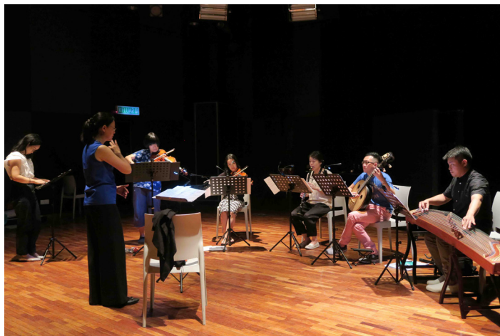
Figure 40. In 4th SoundBridge Festival 2019, Conductor Xie Ya-ou (China/Germany) rehearsing with violist Yoshiko Hannya (Japan) and Ensemble Studio C for Japanese young composer Natsuki Niwa on her “Under the Steps” for viola solo, guzheng, zhong ruan, violin, clarinet with video projection