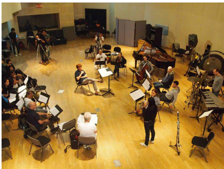
Figure 16. Ensemble Mosaik (Germany) conducted by Enno Poppe (Germany) at the Goethe Institut Southeast Asia Young Composers Competition and Festival 2013 (Thailand)