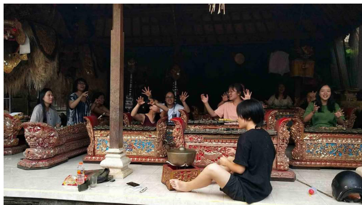
Figure 33. Students of 3 rd edition SoundBridge Indonesia Cultural Field trip and creative workshop 2019 at the house of Semara Ratih gamelan (Ubud, Bali)

The resulting creative workshops emphasize listening, ethical encounter, and collaborative authorship. Rather than extracting material for compositional use, participants are encouraged to reflect on positionality, cultural responsibility, and the politics of representation. These experiences often lead to new works, interdisciplinary projects, and long-term collaborations that extend beyond the temporal boundaries of the festival itself.